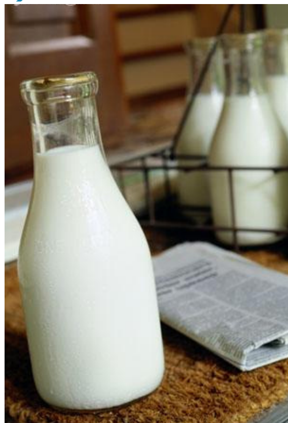
1 . IDF Announcement., JAT Automated Methods, "Small is Beautiful - A topical meeting on new market solutions", May 2003 (Holstebro, DK)

flexibility and versatility. The QuickCheck Flex is ideal for dairy plants that only check their suppliers for added water once a month (or less frequently). With a sturdy stainless-steel carrying case, it can conveniently be stored away until it is next required. Conversely, milk collection stations, cooperative and small dairy plants will find this budget-conscious, dependable instrument with a small bench print, fits comfortably into their limited lab space. The newest member of the Family of QuickCheck Freezing-point Cryoscopes, the QC-Flex gives you the ability to customize your recommendations to customers' needs!